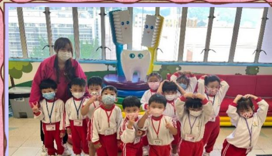
Sunshine Smile Paradise, an Amazing Pleasure!