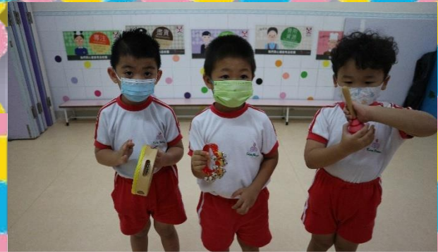
Look! We are playing different music instruments!