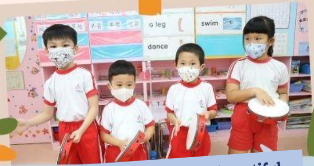
Singing along the music is beautiful, let's play the instruments!