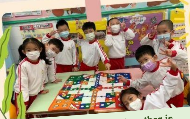
Playing plane chess together is so much fun!