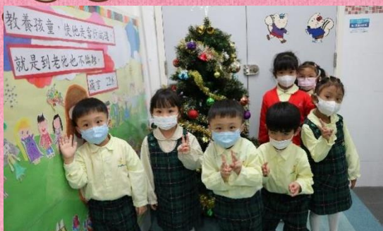
Christmas is here, let's take a photo with the Christmas tree!