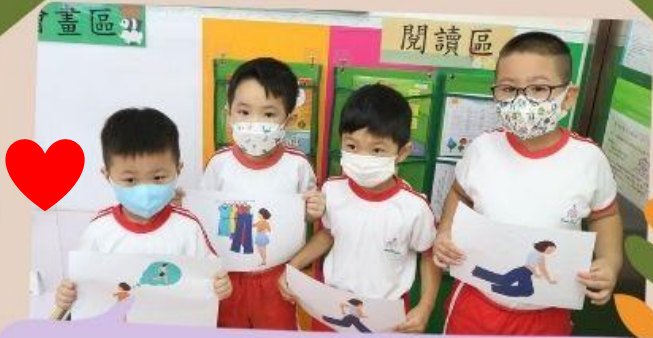
We are creating stories.