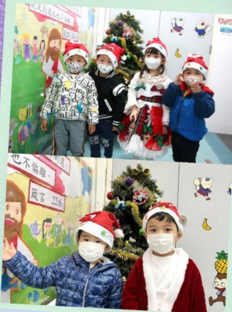
Let's celebrate Jesus's Birthday together!