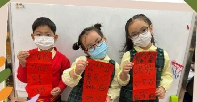
Let's write Fai Chun together!