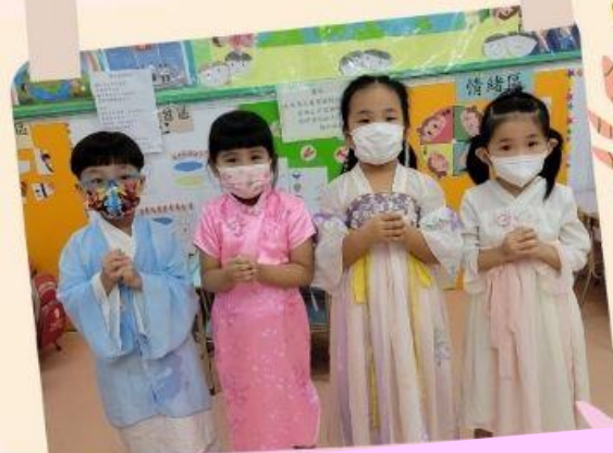
We all are beautifully dressed up!