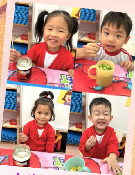
Let's taste different flavors together!