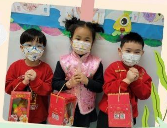
We wish you a cup full of blessings!