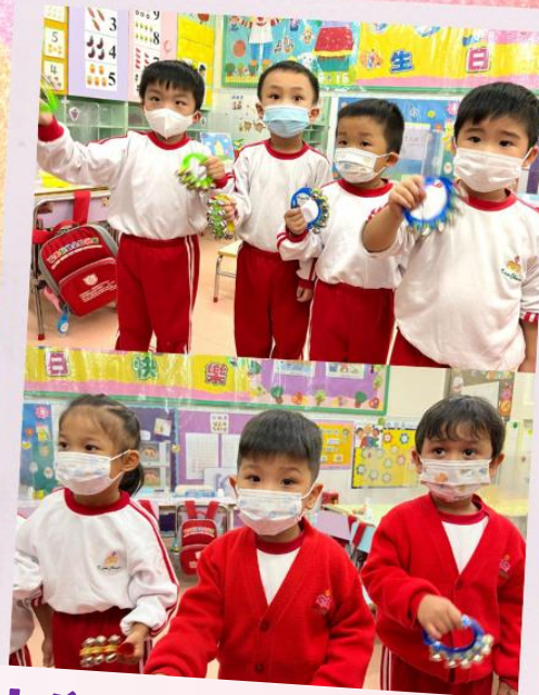
Let's play the bells together!