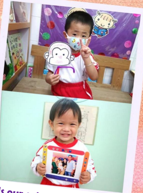
Is our artwork beautiful?