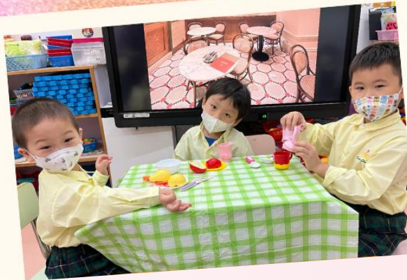
Let's go and eat at the restaurant together!