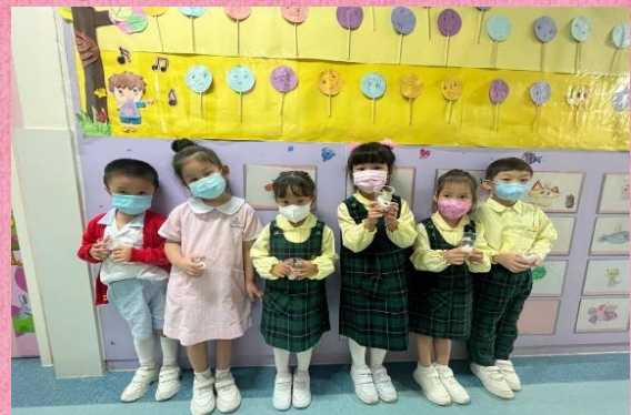
Let's grow different kind of beans together!