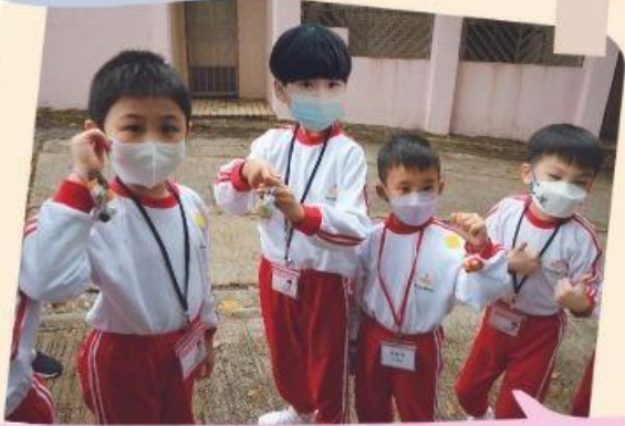
We visited the Nature Education Centre to make sachets which was so much fun!