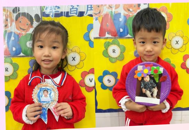
Let's do arts and crafts together!