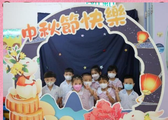
Let's eat mooncakes to celebrate Mid-Autumn Festival!