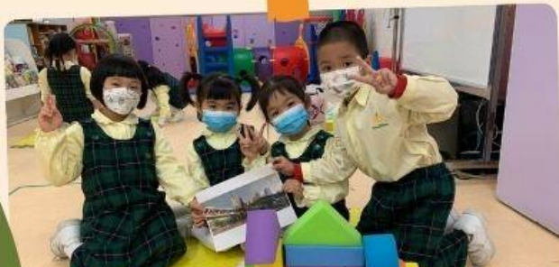
Come and see we are building bridges!