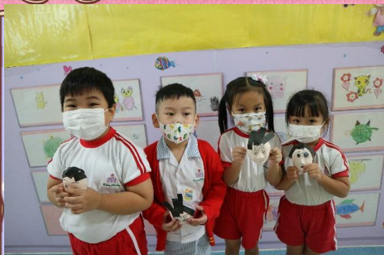
We made human face masks!