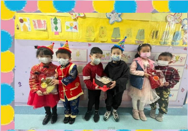
Let's learn about Lunar New Year Food and celebrate the festival!