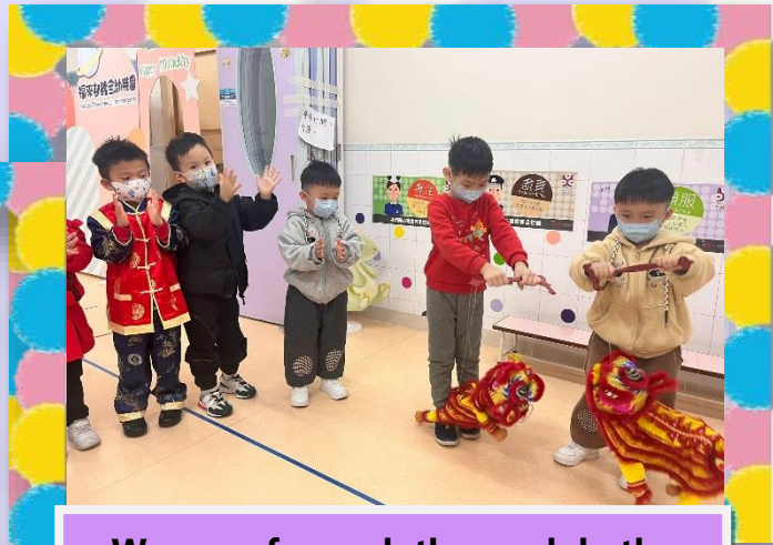
We wear fancy clothes and do the dragon dance together!