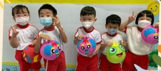
Mid-Autumn festival is about playing with lanterns!