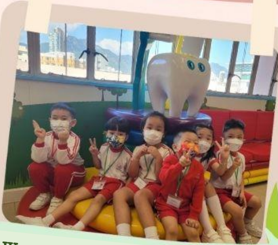
We visited Sunshine Smile Paradise!