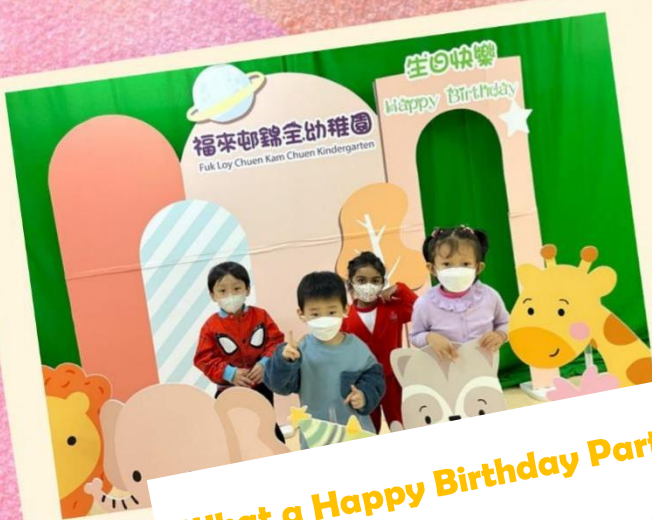
What a Happy Birthday Party!