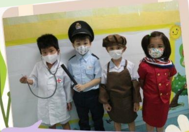
Guess, what my occupation is?