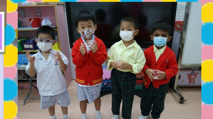
"Season" theme! We planted the seeds!