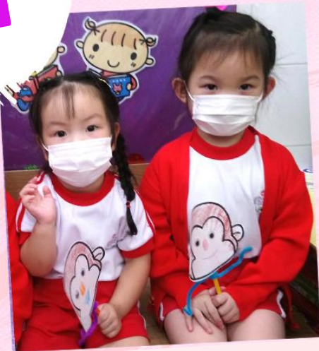
We are good Friends!