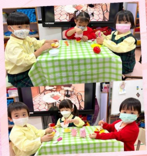
What would you like to eat?