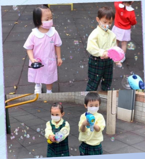
Bursting Bubble makes us happy!