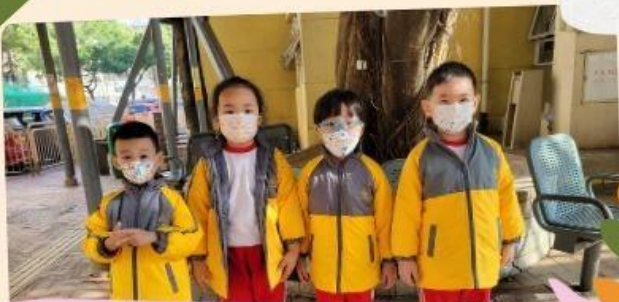
We toured around our community!