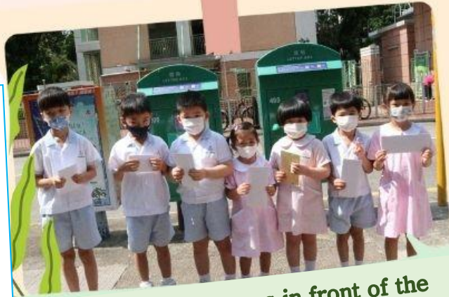
Let's take pictures in front of the mailbox!