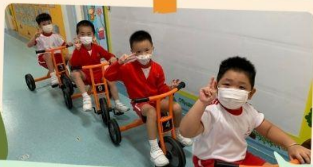
Daily exercise is good for health!