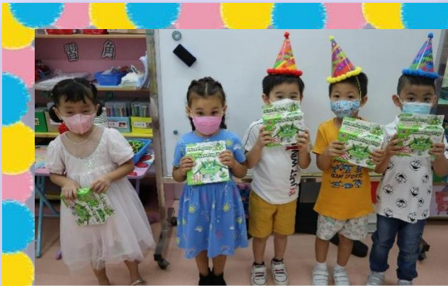
Let's celebrate the birthday of the birthday Stars together!